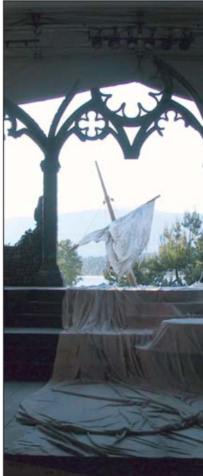
Twelfth Night Detail from Set Photo

An online portfolio is available at www.kevinmcallister.com